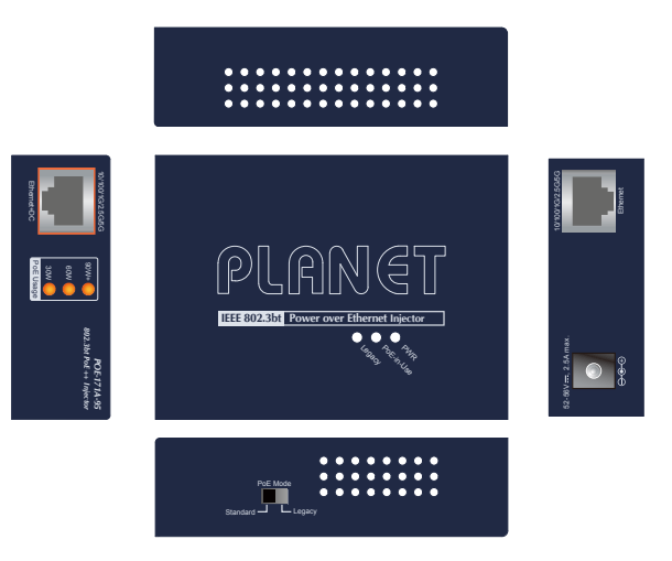
Figure 2: POE-171A-95 Outlook