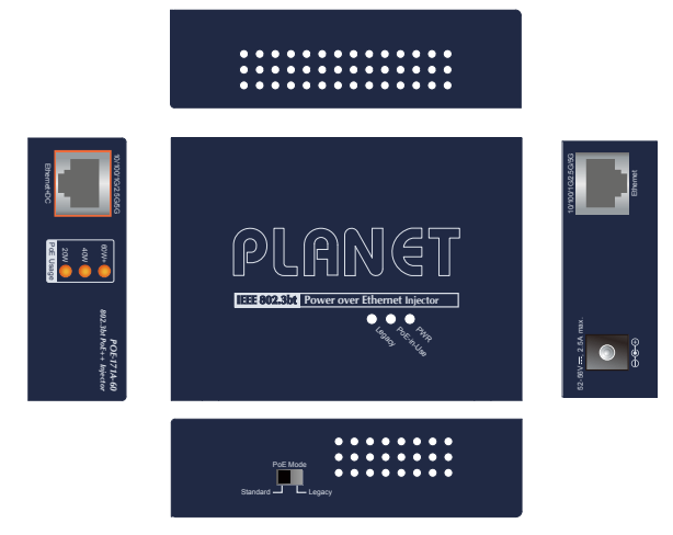
Figure 1: POE-171A-60 Outlook